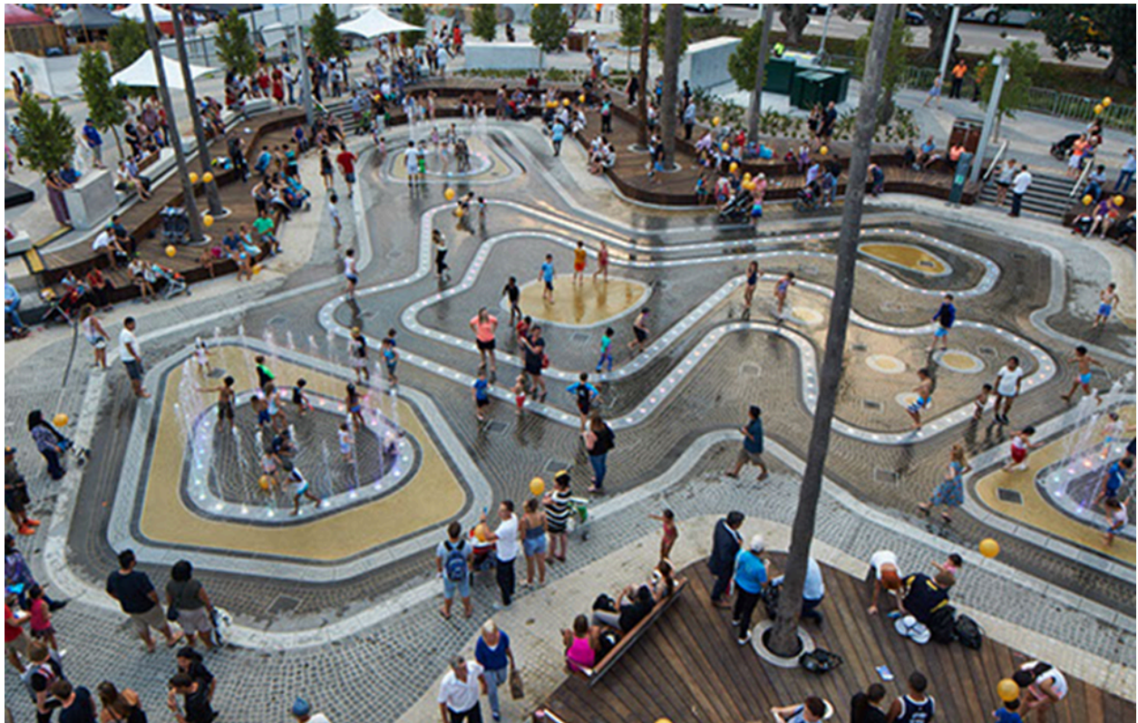
Figure 1. Picture of a water square shown as inspiration for Lachine-Est. Presentation from Montreal water department in Atelier Lachine-Est participatory workshop on ecological innovations, May 6, 2020. project by TCL.